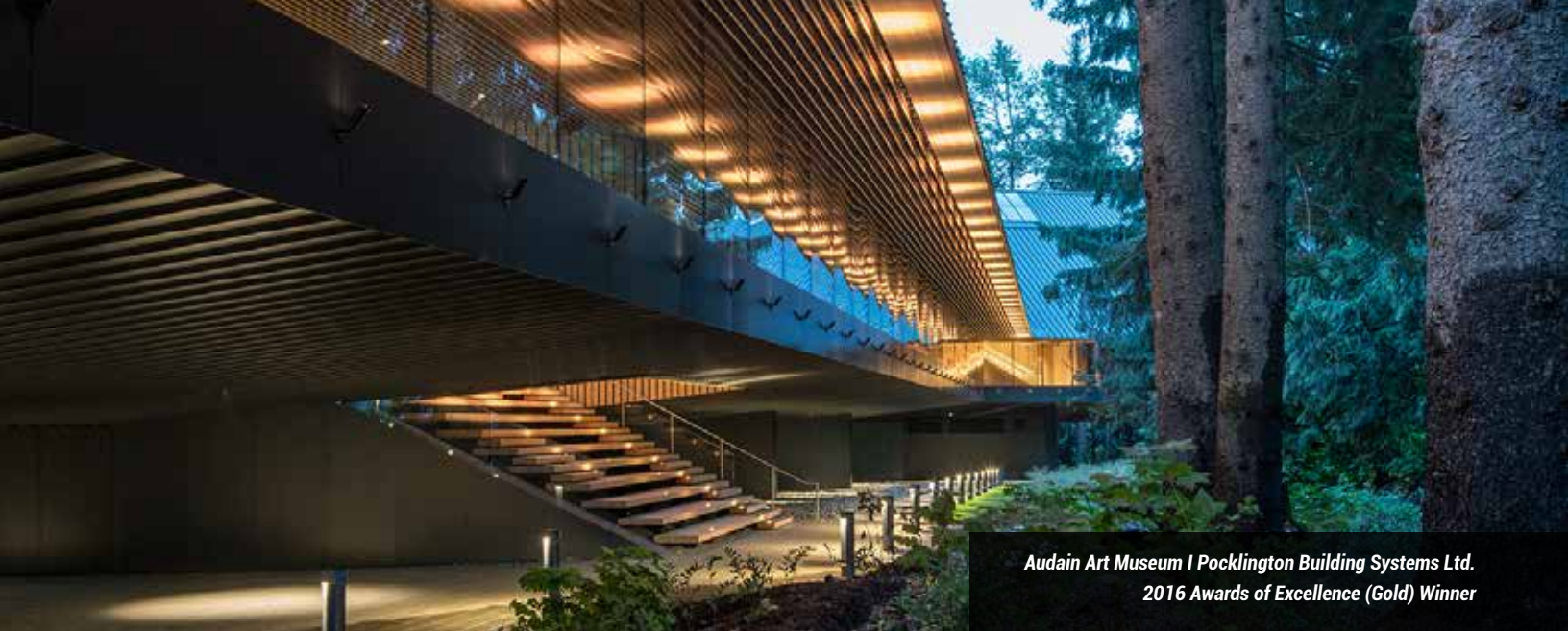
Audain Art Museum | Pocklington Building Systems Ltd. 2016 Awards of Excellence (Gold) Winner