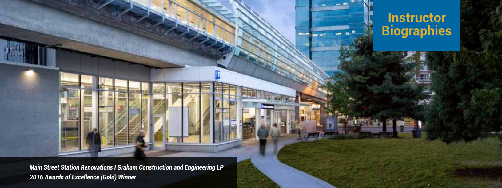
Main Street Station Renovations | Graham Construction and Engineering LP 2016 Awards of Excellence (Gold) Winner